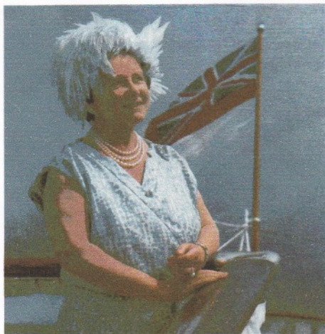
OFF NEWFOUNDLAND 1967