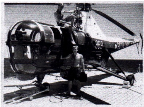
On the flight deck of HMS Vidal with Chief AE Ken Measures, I'm holding bag with spare mags for F24

Broke my femur to bits on my Ariel 350 NH motorbike and spent four months in a civvy hospital in Taunton, then back to Yeovilton. Soon I was on my way to Chatham to join the RN's first purpose built survey ship HMS Vidal equipped with possibly the last operational S51 Dragonfly fitted with twin F24's with a type 35 control in the cockpit. Smashing time, lots of flying around the West Indies and loads of rabbits.