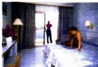
Hotel Qawra Palace Qawra, (Malta), Malta & Gozo