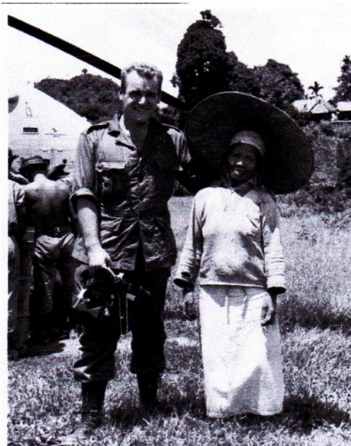
My land Dyak 'Girlfriend' when filming for movietone news in Borneo, circa 1963

aircraft was a borrowed Wasp from HMS Dido, way above its service ceiling.