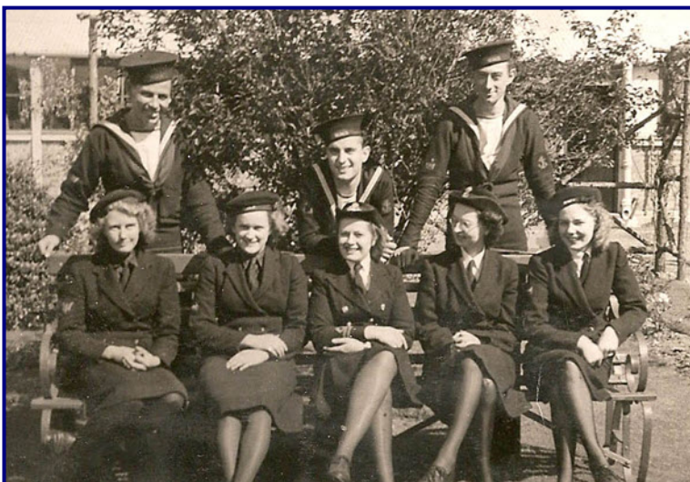
Photograph of the RN Film Unit editing staff taken outside the cutting rooms at Tipner.