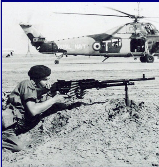
Ma'alla, Tawawi & Steamer Point. ADEN 14th October 1967

These marines seen practising for the next day were in danger of having a Wessex 5 land on their heads