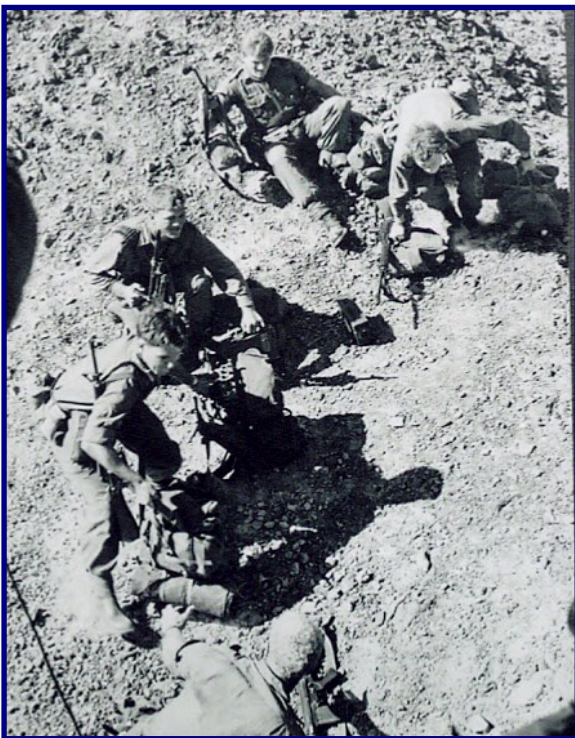
The Owen Line Ridge

One of my favourite photos of the whole day as these marines slid and scrambled their way down the shale perched on the Owen Line Ridge above the Crater City.