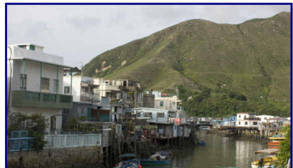
The creek Tai-o village