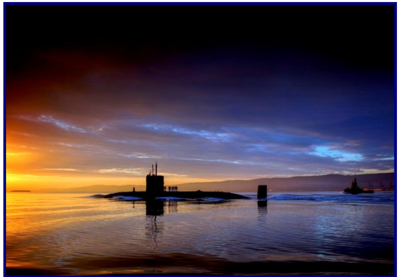
HMS Triumph coming in HMNB Clyde, 7th of the Trafalgar Class.