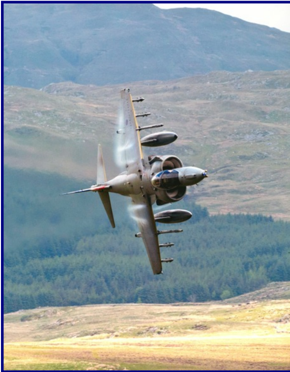
Low flight of a GR9 Harrier. Taken for the RN Amateur photographer competition. Highly Commended 2011.