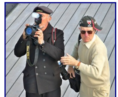
Have you got them all in the shot