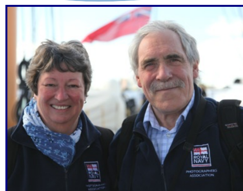
Your Editor wearing the latest RNPA Fleece