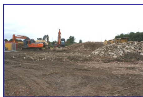
Old Cine processing/Stand Easy/ Changing rooms building.

It looks like its going to be a Park and Ride area and the full redevelopment scheme can be viewed at http://www.portsmouth.gov.uk/living/8781.html