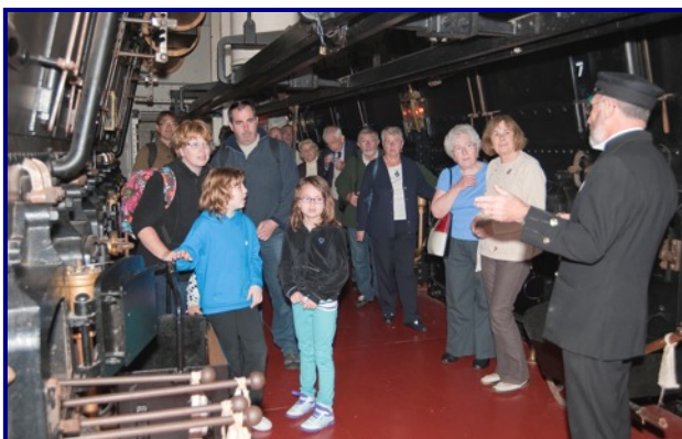
Down in the engine room.