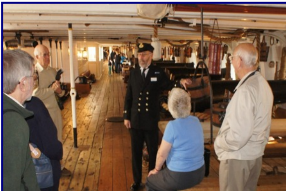
On the Gun deck where the crew also slept.