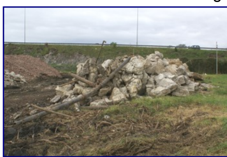
Stills Section on the right with Sound Studio in background