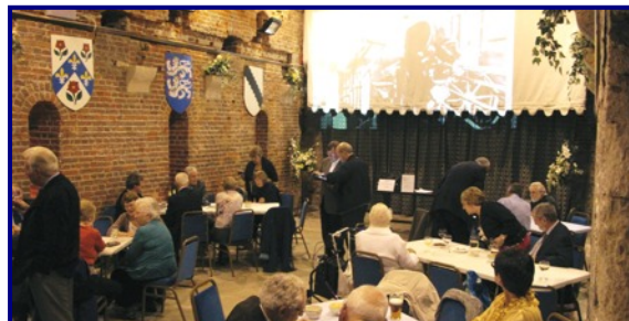
The Square Tower had a lovely atmosphere