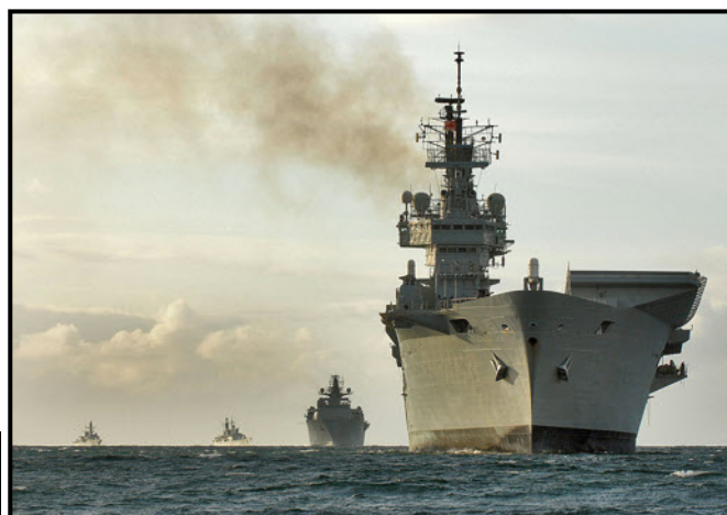
HMS Ark Royal taking part in Ex-joint Warrior formerly know as the joint maritime course.