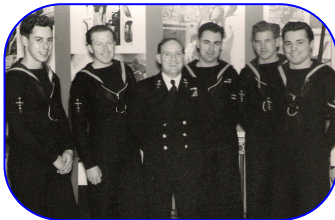
2. Taken at the Ilford Exhibition of Naval Photography on 21st December 1956

Anyone recognise anyone else? Detail please. email me for high resolution scans if required