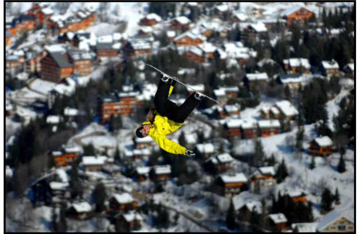
The Inter Services Ski & Snowboard championships takes place at Meribel, France. Boarders take part in Accenture Snowboard Slopestyle Final. Picture shows the army trainer getting some air during a break in the final.