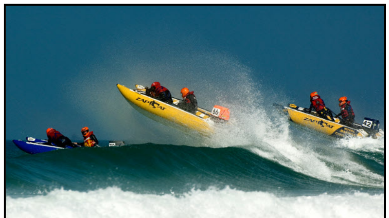
The final Grand Prix of 2008 Zapcat National Championship Season at Water Bay near Newquay, four Royal Marine teams took part.