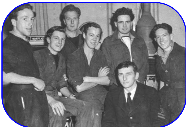
1. HMS Glory Phot section c1946.

Eventually we may have to get some early details from Practical Photography and go into the Navy News Offices but if anyone has any results not listed I would be grateful for a copy. No pictures at this stage please but it would be useful to know how many Trophy winning pictures are still out there. By the time you read this we hope to have the Historical site within the main RNPA website area. The URL is: http://www.history.rnpa.info . I will be running the new and old sites in parallel until we are sure that the new one is working properly.