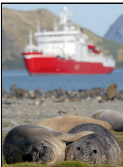
HMS Endurance in Shomness Bay end of Shackleton walk.