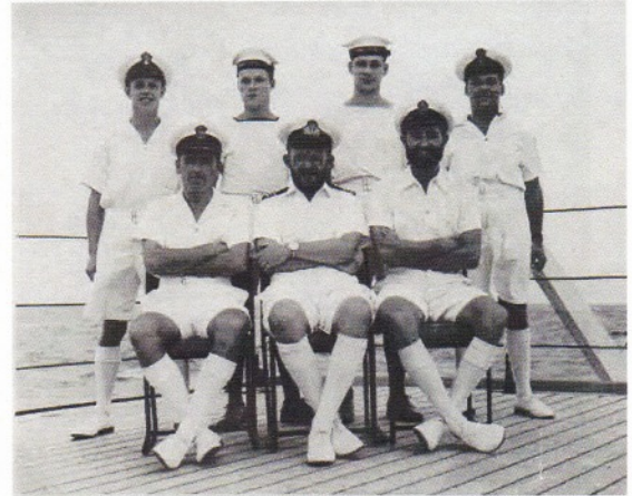
Air branch on Vidal

Ten months later I was on the Vidal, another survey ship, in the West Indies, replacing a P.O.Phot who had been sent home ill. We were based in Kingston, Jamaica but visited and surveyed off many other Islands.