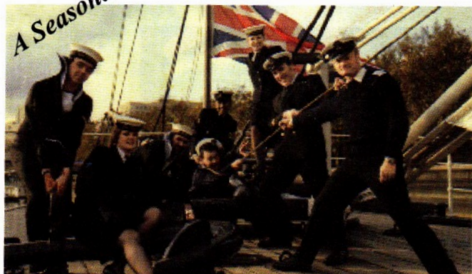
A Seasonal Photo Find