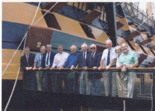
RNPA members visit HMS Victory