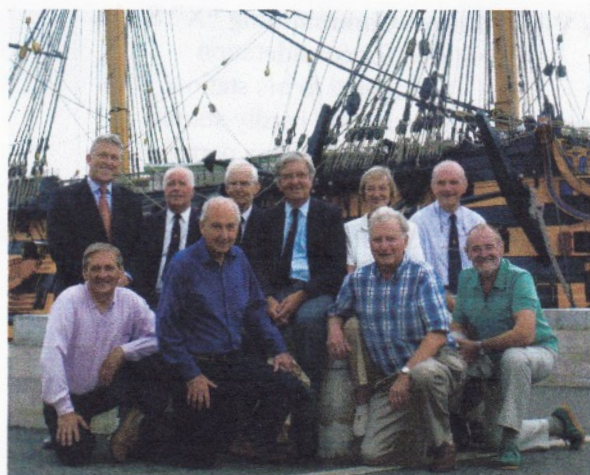
RNPA members on HMS Victory