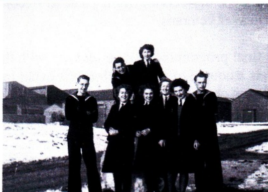
HMS HERON SECTION PHOTS 1944/45