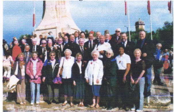
The majority of our group at the Malta Cenotaph