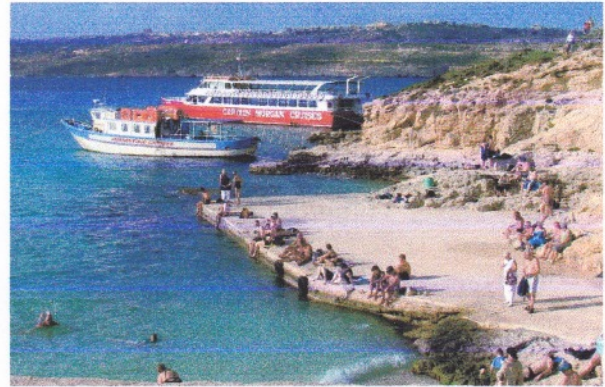
Some of us on Comino Island enjoying the warm weather and swimming on tour around Malta.