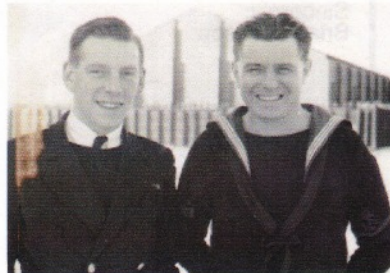
Photo Section HMS Landrail 1944