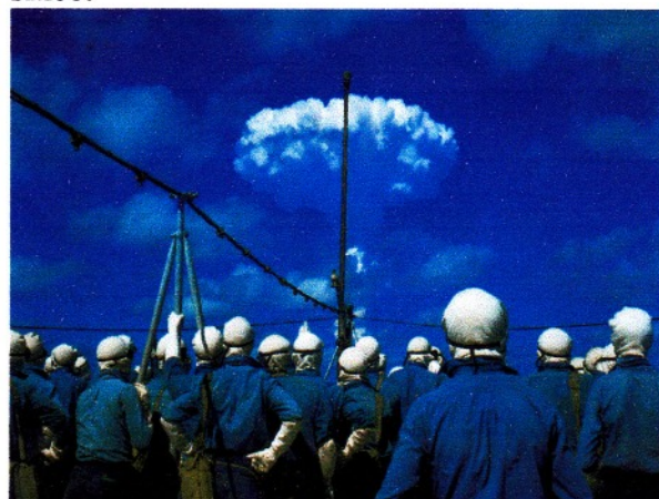
Britains first megaton Nuclear bomb, Christmas Island

HMS Cook beckoned next with 18 months sun-bathing in the South Pacific. Called at Christmas Island en-route to witness Britain's first megaton nuclear bomb, never felt right since!