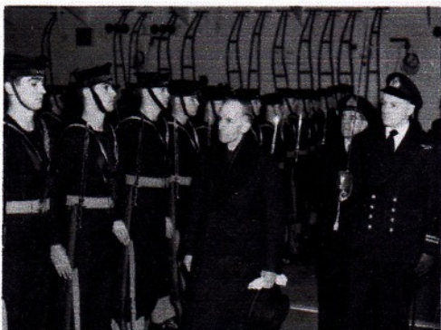
Canadian High Commissioner on HMCS Warrior