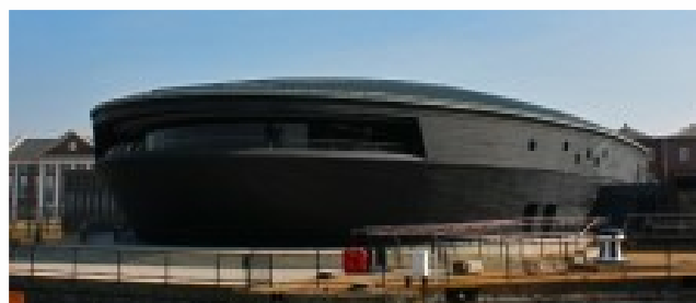
The Mary Rose - & her new home