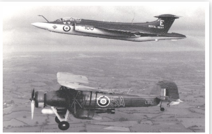
one of his favourite photos he said, the Buccaneer pilot had a problem flying so slow with the Swordfish that he was almost stalling.