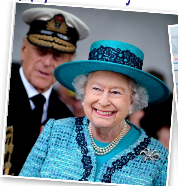
Her Majesty at last years naming ceremony of HMS Queen Elizabeth.