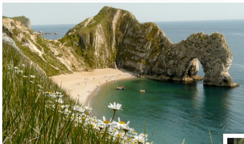
I took Durdle Dor a few years ago as we walked the cliffs around the bay and the daisy were we stunning I used my Cannon Mk 5D.

The Tulips we in Keukenhof Gardens Holland - what I really like it was probably the sharpest photo I have taken