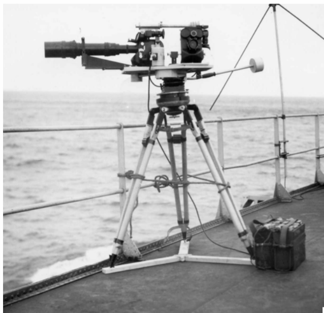
"Double Headed Monster" rigged on the mine layer HMS Apollo during gunnery trails in spring 1957

In early 1943 the Admiralty Research Laboratory developed a prism which was fitted in front of the lens on the Low angle marking camera. This produced an image of a very bright searchlight, shone from the firing ship, pointed at the target, and superimposed with the fall of shot on one negative. The shoots were thrown off at 3 or 6 degrees and ranges of 22000 yds were normal. The Low Angle Marking camera Mk 1V produced an image 7x2 inches on 70mm film.