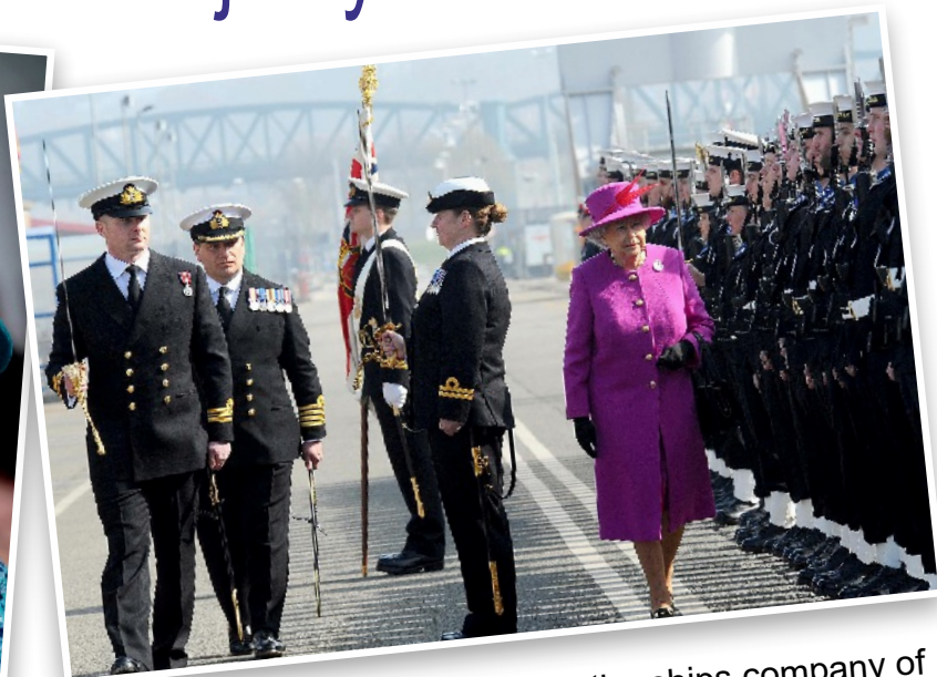
The Queen on duty inspecting the ships company of HMS Ocean as part of her role as the ships sponsor, at a redication ceremony.