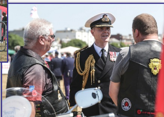
Commodore Jim Higham OBE ADC RN talking to local residents of Portsmouth.

The Armed Forces Day flag was raised to signal the start of the day's festivities with all three services and veterans represented. Regular, Reserves, Cadets and Veterans marched from the D-Day museum in Southsea to Southsea Common where personnel from HM Naval Base Portsmouth formed the guard of honour, led by the Royal Marine Band Portsmouth. The Portsmouth Naval Base Commander, Commodore Jim Higham OBE ADC RN said: "The turn out here today at Portsmouth Armed Forces Day is a true testament to how integral the Armed Forces, and in particular the Royal Navy, is to Portsmouth and the wider Hampshire area.