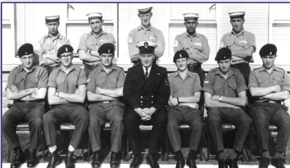
Phot 2. Number 19. HMS Fulmar Hist 567

Not sure where Pete went in the RN but he was at FPU HMS Excellent, Whale Island 76- 78 ish PO of the Stores