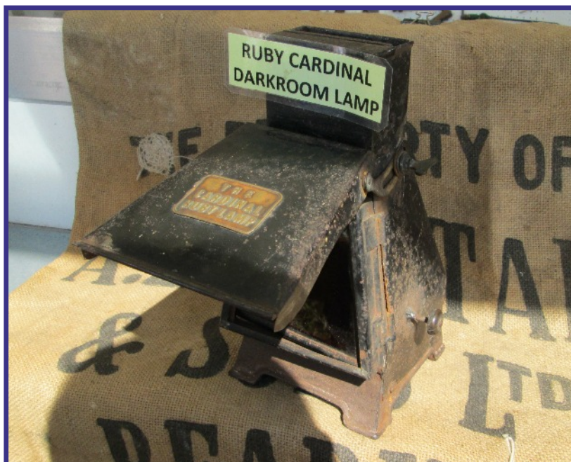
Ruby Cardinal Darkroom Lamp

The lamp dates from around 1870, has a paraffin wick lamp and red and yellow filters. Light intensity is controlled by raising or lowering the hinged front.