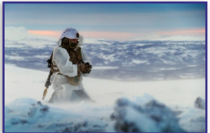
Royal Marine assault engineer of 45 Commando prepares a charge during Ice demolition training in the Arctic circle. This image won the Operation Prize.