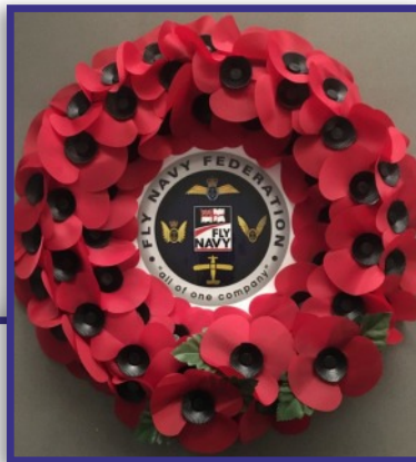
Wreath laid by FNF on behalf of the FAA Association