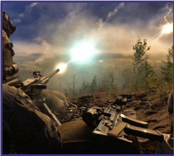
Royal Marine of 45 Commando firing .50 calibre heavy machine gun in Estonia on exercise Baltic Protector 2019.