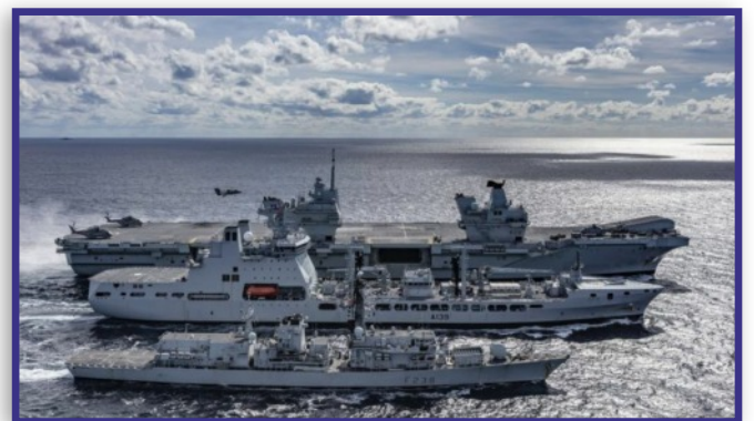
An F-35B jet lands on HMS Elizabeth as she sails closely with RFA Tideforce & Type 23 Frigate HMS Northumberland.