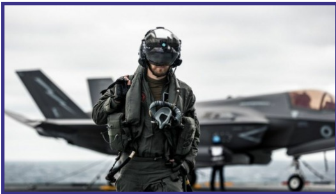
A British F35B Lightning jet pilot walks across HMS Queen Elizabeth flight deck with his fighter jet in the background.