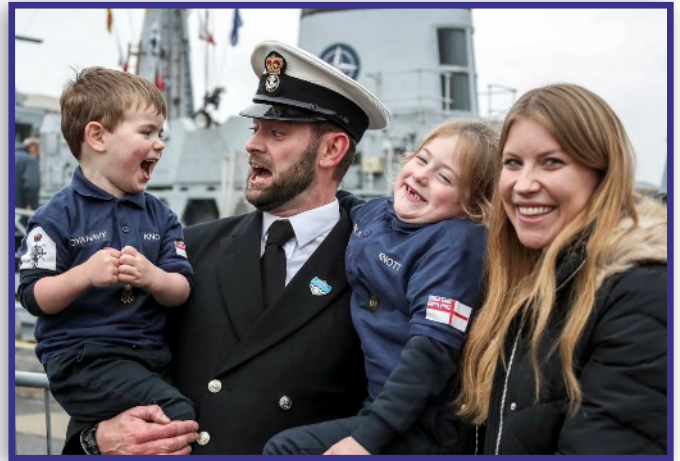
A member of HMS Callistock's crew returns home to his family after ten months away on a NATO deployment.

The RN and RM charity family and friends award.