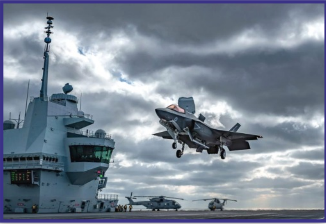
HMS Queen Elizabeth flight deck during operational testing with the UK F-35B Lightning jet.