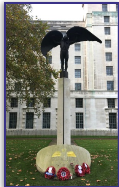
The FAA Memorial