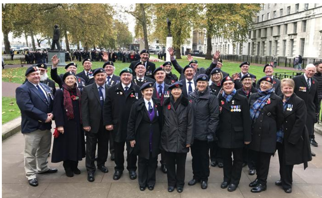
1 The 2019 Group by the FAA Memorial

We have managed to keep up numbers even though some of us have had to call on the NHS to fix things. We are hoping that all that join us this year, are so enthralled by their getting together with other Ex- Phots, that they continue to join the RNPA Marchers in the years to come. We had a few new people join us last year and they thought the day was a fantastic and emotional experience.